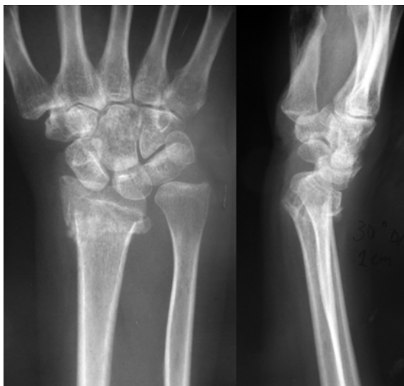
Fig. 1 Posteroanterior (left) and lateral (right) radiograph of the right wrist reveal a dorsally displaced extra-articular distal radius fracture. The fracture is closed to the “watershed” area and surrounded by a callus formation

ledge, there are 33 cases reported in the English literature (8-15) . Surprisingly, there are fewer reports of the flexor tendon injuries after non-fixed-angle volar plating. Details of the fixed-angle plate group and non-fixed-angle plate group are showed in the Table 1 and 2,