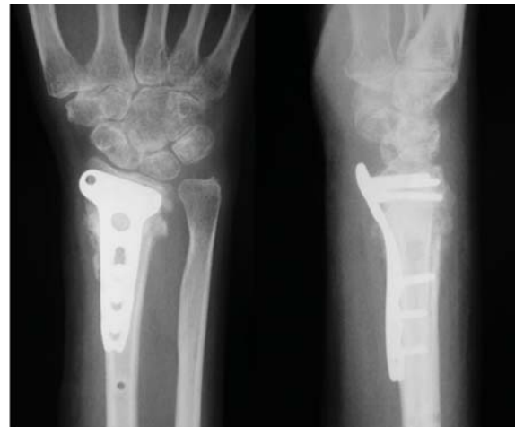
Fig. 2 Postoperative posteroanterior and lateral radiograph reveal an acceptable alignment of the distal radius. The plate was distally placed. The gap between the distal portion of the plate and radial styloid is noted